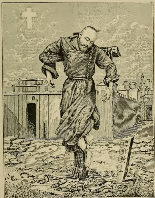
THE MARTYRDOM—SEPTEMBER 11TH 1840.